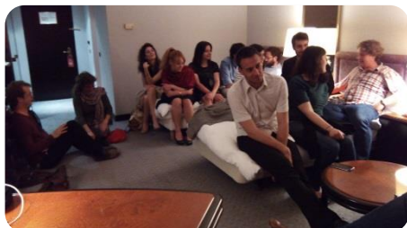
Figure 8: One of our meetings