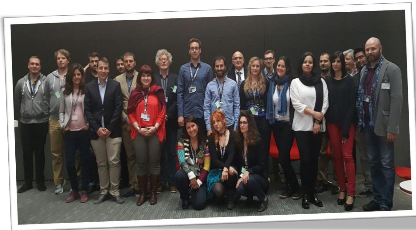
Figure 4: ITN-DCH @ CASA Workshop

The Conference for Animation and Social Agent took place in Geneva from the 23 th to the 25 th of May.