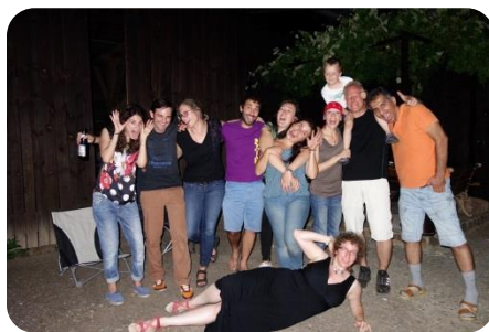
Figure 12: ArcTron3D farewell party

Right now, I realized it turned out to be true: we have been sharing conferences, writing papers, deliverables, reports and more reports, sharing ideas, planes, social dinners, socks... but over all we have spent our birthdays together, either with a meter of beer or with five kg of Nutella, we have learnt