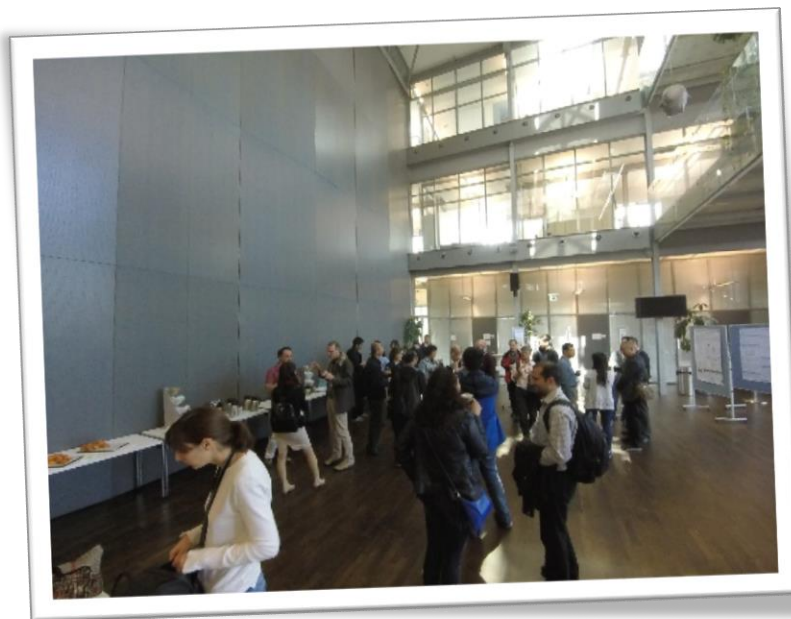
Figure 6: CASA Conference

Finally the conference itself with all presentation of papers took place on Tuesday and Wednesday.