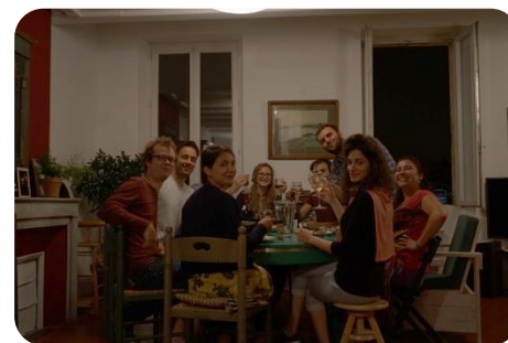
Figure 23: Fellows visiting the best deliverable

Greek dances and some essential words in all the languages, we have been driven a boat, hiking, dancing, cooking "e"spanish omelette in the early morning, skiing, sledging... joking, sharing pictures and moments.