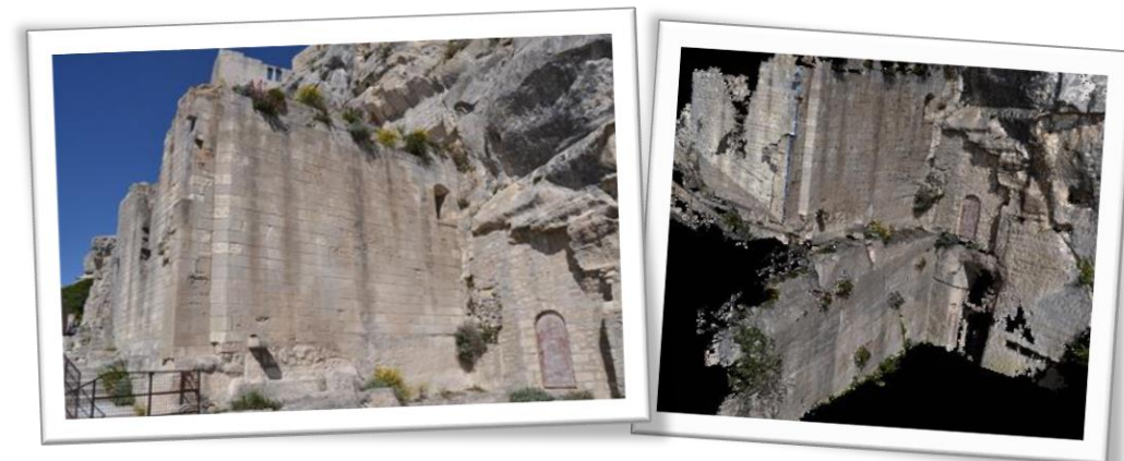
Figure 2: Saint Catherine Chapel in the Les Baux-de-Provence. Left: An image taken during the acquisition campaign. Right: A corresponding 3D reconstruction with the use of MicMac

also workshops related to the historical and spatial data analysis and applications. To be trained on the aforementioned software, a