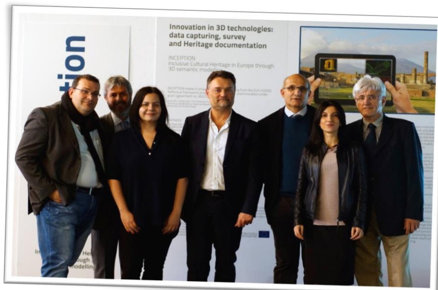
Figure 7: ESR14, while she tries the portable laser scanner (left). Two EU projects together: ITN-DCH and INCEPTION project at Salone del Restauro (right).

Salone del Restauro is an event, which took place in Ferrara, Italy, from 6th to 9th April 2016. The event's main goal was the promotion of the cultural economics and its role in conservation, protection and promotion of the tangible and intangible Cultural Heritage. A plethora of companies and academic projects participated in the Salone del Restauro by presenting their work to the public, that many of them were students and young researchers.