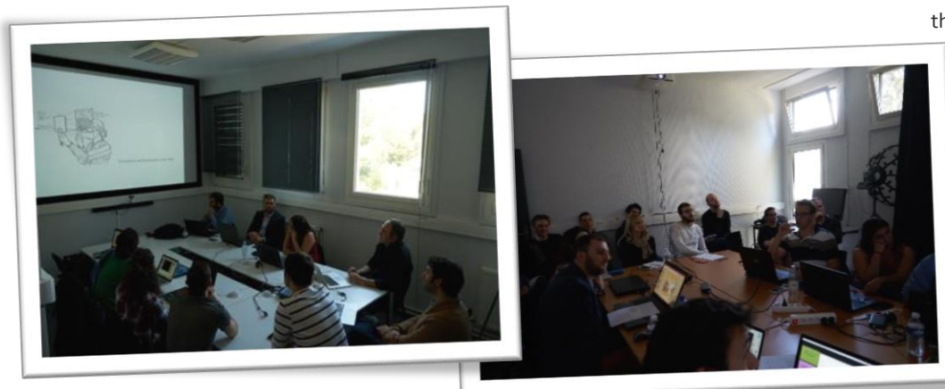
Figure 1: ITN-DCH Fellows' and CNRS-MAP members' introduction

The lectures and presentations were given not only by the members of MAP laboratory but also from contractors during the duration